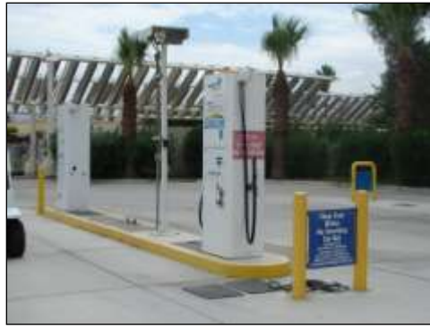
Figure B. SunLine Transit fueling station

AC Transit's hydrogen station in Emeryville is currently the largest and most-modern transit bus fueling station in the U.S (Figure C). The station, which started operation in August 2011, serves as a dual-use station where passenger vehicles can access a public dispenser outside the bus yard. The separate bus and car dispensers share much of the station's hydrogen equipment, capitalizing on the need for each of the transit and private-use vehicle markets. The station has a scalable capacity, with a baseline capacity of 360 kg of hydrogen fuel per day for buses at 35 MPa and 240 kg per day for cars at both 35 and 70 MPa, an amount sufficient to fuel 12 fuel cell buses and between 40 and 60 cars. 21 Excluding the implementation and capital costs for the hydrogen station equipment, the combined cost of O&M and hydrogen to fuel buses at this station is approximately $10.50/kg dispensed.