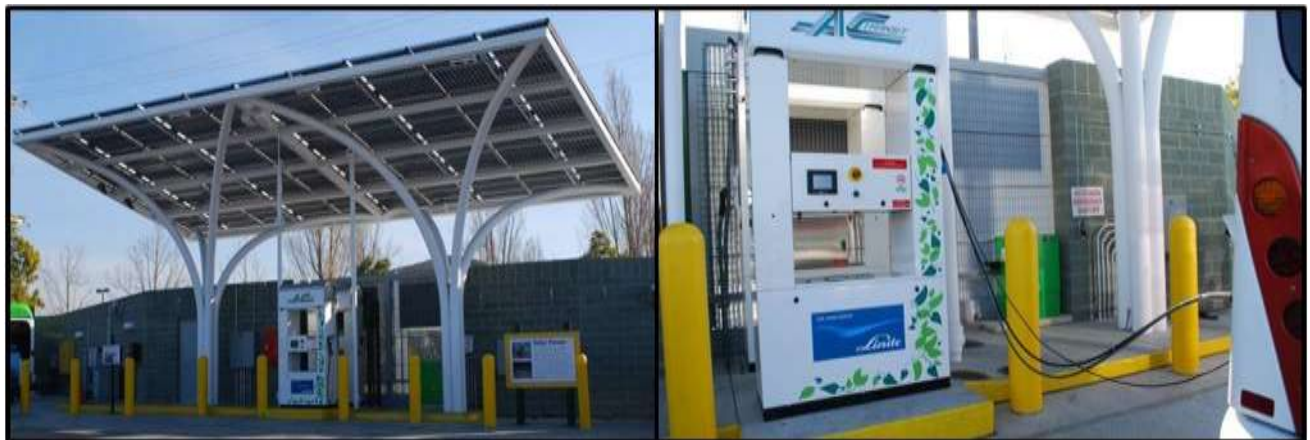
Figure C. AC Transit fueling station

The performance of this station to fill multiple buses consecutively at a speed of six to eight minutes per fill -a rate equivalent to diesel bus fueling- is achieved through the use of fast-fuel technology. Should AC Transit decide to increase the number of FCEBs, the station system is designed to easily expand its capacity to accommodate up to 24 buses by adding additional compression and gaseous storage equipment. A second station in Oakland will open in late 2013 with a design capacity to fuel 12 buses rapidly and in succession. It also can be expanded to fuel 24 buses. Typical scheduling and service requirements make it necessary to fuel the buses between 11 p.m. and 5 a.m. to enable the buses to stay in continuous service from 5 a.m. to 11 p.m.